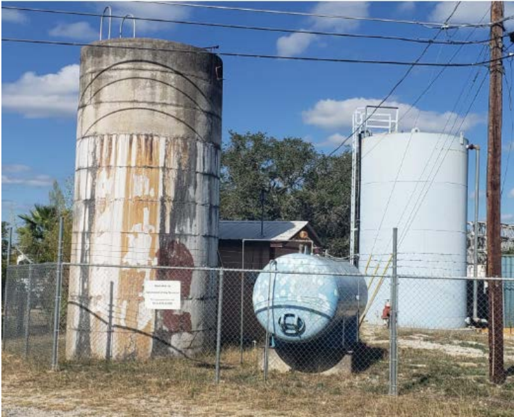
In the beginning - 2011